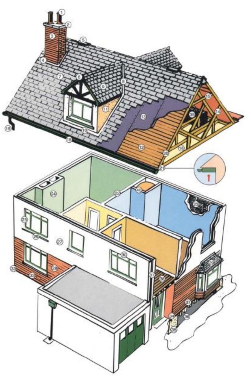
Reference may be made in this report to some or all of the above component parts of the property. This diagram may assist you in locating and understanding these items.